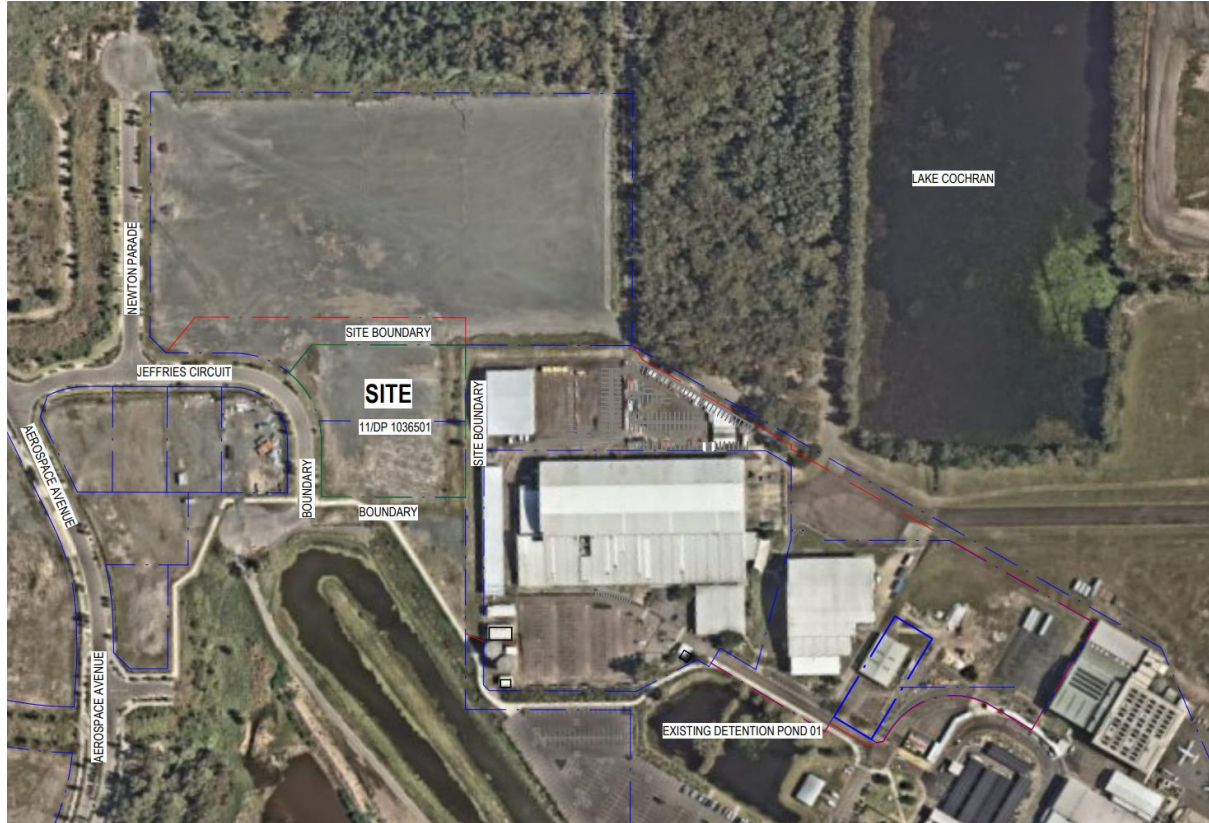
Figure 1: Site Plan

The site forms part of Proposed Lot 100, and Proposed Lot 101, and 102 in Lot 11, DP 1036501, 38 Cabbage Tree Road, and part Lot 43, DP 1045602 and part Lot 103, DP 873512, Williamtown Drive, Williamtown. The site is accessed via Jeffries Circuit.